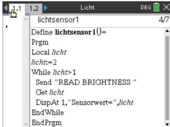
Figure 3: Program code