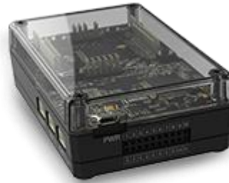
Figure 1: TI-Innovator Hub

https://education.ti.com/de/products/micro-controller/ti-innovator