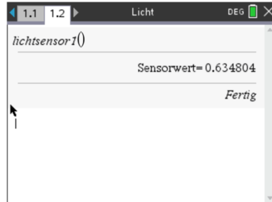
Figure 4: Program Call with Output

Create the program as shown. When everything is saved, the program can be started with the call "lichtsensor1()". You can easily exit the program by covering the light sensor with one finger. Position the light sensor in front of the different light sources. Try different distances. You may have noticed that the light sensor receives less and less light as the distance increases. An important conclusion is the correct positioning of a work lamp at the workplace. Also the different lights give different sensor values.