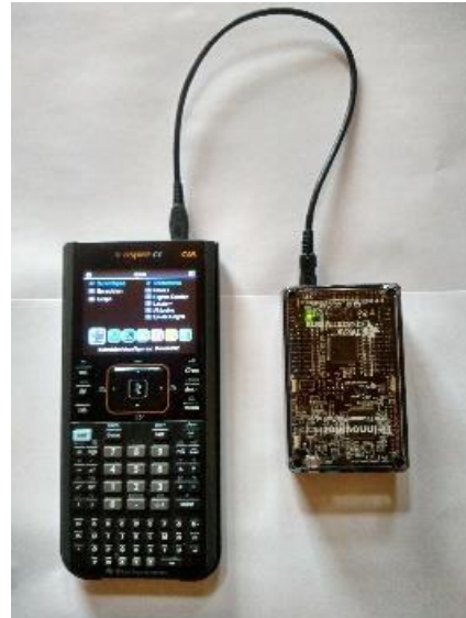
Figure 2: Both devices ready for use

The TI-Innovator Hub has a light sensor. It is now necessary to learn more about this sensor together with the computer so that the various light sources can be examined. Connect the calculator to the hub with the included cable. The side with the printed A connects to the calculator. Switch on the calculator and after a short time a green LED on the hub will light up. Then everything is ok. You are ready to start.